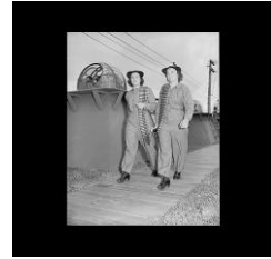
First WAVES Machine Gun Instructors

https://www.womenshistory.org/womens-history/womens-history-month