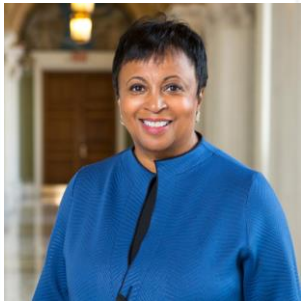
Dr. Carla Hayden, 14th Librarian of Congress